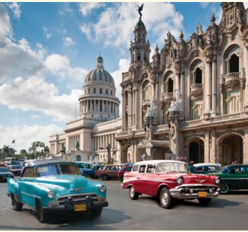
The streets of Cuba are a treasure trove of American classic cars lovingly and innovatively preserved.