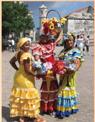
Vibrant batatas cubanas (traditional dresses) reflect Cuba's Spanish and African roots.

CHALLENGING Vigorous pace, frequent movement, extensive walking over uneven surfaces, hiking and stair climbing.