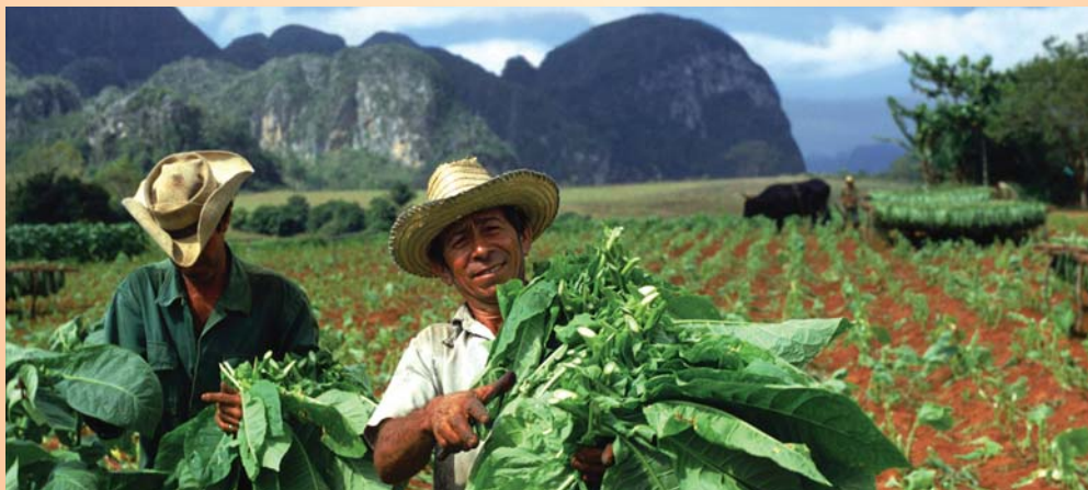
The agricultural province of Pinar del Río is home to the fertile Viñales Valley, a UNESCO World Heritage site, where farmers notably grow much of the world's premium cigar tobacco.