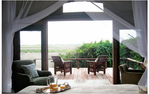
Main lodge (above) and private thatched tent, Royal Zambezi Lodge