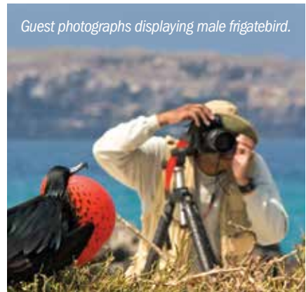
Guest photographs displaying male frigatebird.

An exclusive expedition photography program means that you travel with, and benefit from, an onboard Lindblad-National Geographic certified photo instructor. A naturalist who has been trained to teach by the best in the business at National Geographic, he or she will help you better understand your camera settings, the basics of composition, and how to capture incredible wildlife behavior. So whether you use a smartphone, a point-and-shoot, or a sophisticated DSLR, count on returning home with improved skills and your best shots ever.