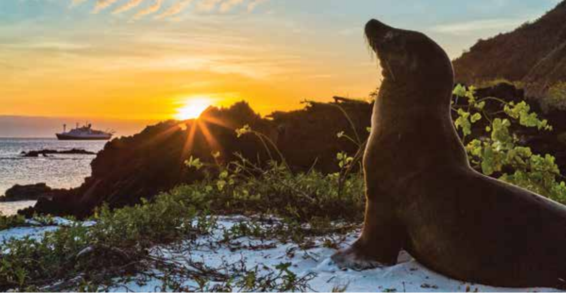
Galápagos sea lion enjoying the sunset.

the only species of flightless cormorant in the world, and the only penguin species that inhabits the equator. Cruise by Zodiac, hike against the backdrop of giant shield volcanoes, and snorkel in the cool, rich waters that often draw whales and dolphins to the area.