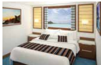
Artist renderings top to bottom: National Geographic Endeavour II; the newly renovated lounge with panoramic windows; typical Category 3 cabin with large window and two single beds that can convert to a queen.