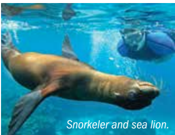
Snorkeler and sea lion.

The Galápagos undersea is a marvel. Snorkelers will enjoy encounters with sea lions, sea turtles, penguins, tons of fish, and even multiple shark species. You'll have opportunities to snorkel nearly every day, and we'll provide all your snorkeling gear, including wetsuits. Prefer to stay dry? The