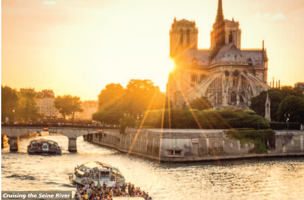
Cruising the Seine River

neighborhood with strong ties to the French Revolution. See the hall where Danton and the radical Cordeliers held their debates, visit the oldest café in Paris and hear about the guillotine and the death of Marat.