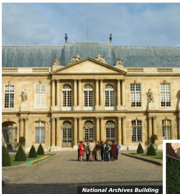
National Archives Building