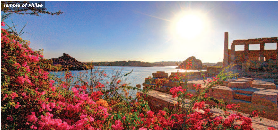
Temple of Philae