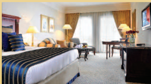
INTERCONTINENTAL CITYSTARS CAIRO CAIRO

Our travel experts have selected these luxury properties, each in a prime location, for your comfort. Details in the design and décor celebrate the local culture and enhance the ambience of each hotel. Their restaurants feature menus of elegantly prepared local and international cuisine. Of utmost importance is the superior quality of the services, amenities and accommodations, allowing you to maximize the enjoyment of your stay.