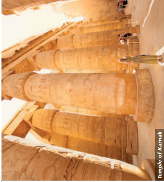
Temple of Karnak