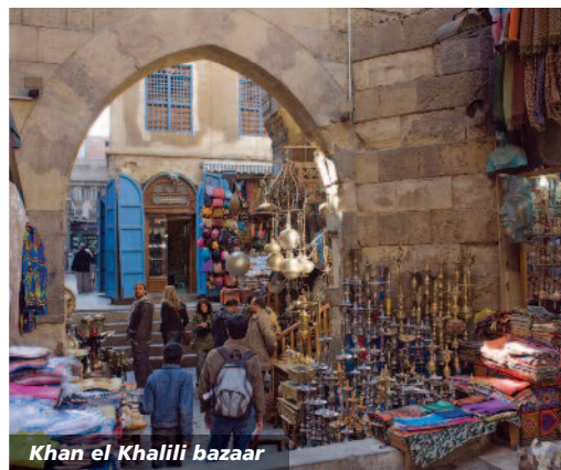
Khan el Khalili bazaar