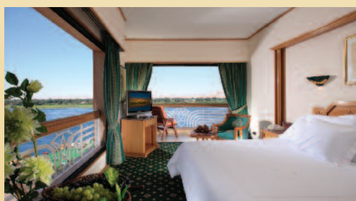
SONESTA ST. GEORGE HOTEL LUXOR LUXOR