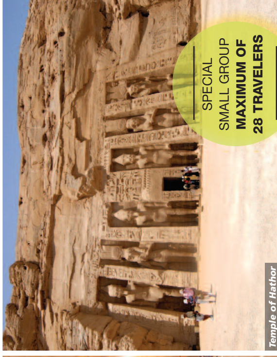
Temple of Hathor

SPECIAL SMALL GROUP MAXIMUM OF 28 TRAVELERS