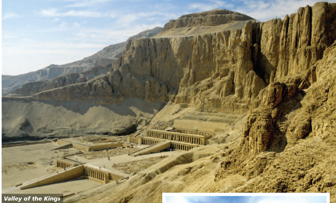
Valley of the Kings