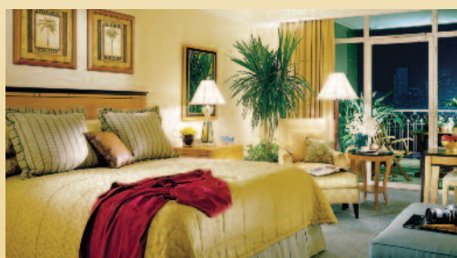
FOUR SEASONS HOTEL CAIRO AT NILE PLAZA CAIRO