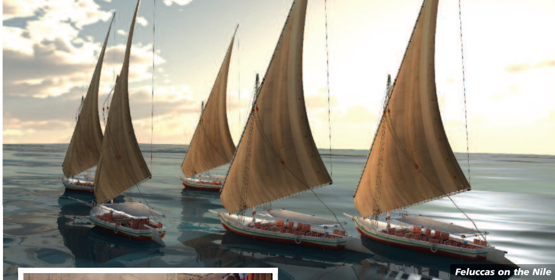
Feluccas on the Nile