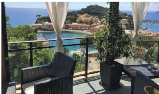
View of Sestri Levante, Hotel Vis à Vis