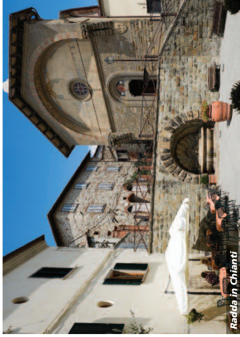
Radde in Chianti