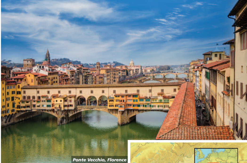
Ponte Vecchio, Florence