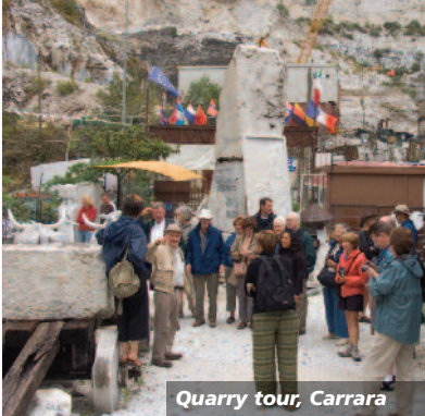
Quarry tour, Carrara