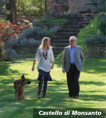
Castello di Monsanto