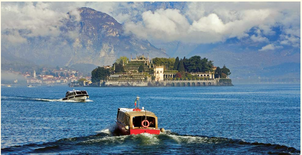
Isola Bella is the most spectacular of the Borromean Islands, located on the Italian side of Lake Maggiore. Visit a magnificent 16 th -century villa and stroll through one of the most beautiful gardens in the world.

CULTURAL ENRICHMENT: Savor the delights of northern Italian cuisine while enjoying dinner in a local Cernobbio ristorante .