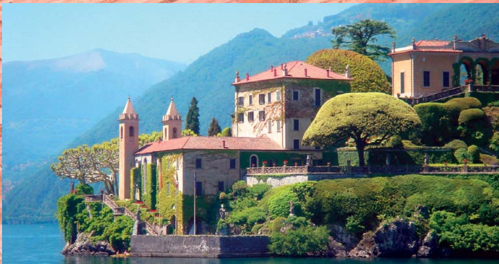
Nestled on the shores of Lake Como and surrounded by majestic Alpine peaks, the legendary Villa del Balbianello has one of the most beautiful and dramatic settings in all of Italy.