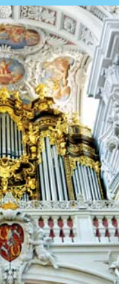
Soft tones of the pipe organ in St. Stephen's Cathedral are a pleasure to humans.

Be on deck this evening as you cruise the Danube's spectacular and fabled Wachau Valley, a UNESCO World Heritage site, where terraced vineyards