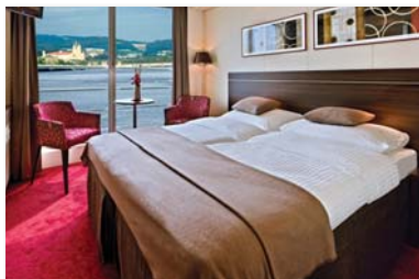
Cabin Category 2

The English-speaking, international crew provides warm hospitality. The ship meets the highest safety standards and is one of the only European river ships to have been awarded the "Green Certificate" of environmental preservation.