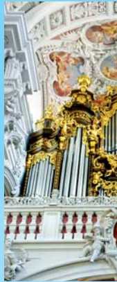
The highest and lowest organ in Passau’s St. Stephan’s Cathedral are nearly inaudible.

Travel across rolling hills and through the bucolic wooded Czech and German countryside to Passau, where three legendary rivers—the Danube, Ilz and Inn—converge. Enjoy lunch in a historic, traditional German restaurant before the walking tour along the cobblestone streets of Altstadt, Passau’s Old Town. Visit the Baroque-style St. Stephan’s Cathedral, consecrated in the 12 th century, where the largest pipe organ in Europe is housed.