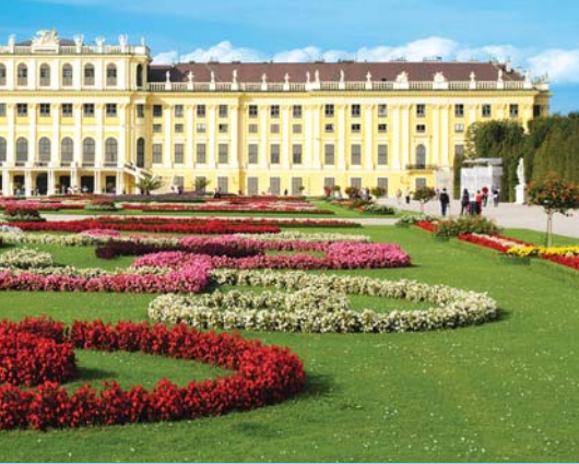
Palace, a UNESCO World Heritage site and summer toilette to Emperor Franz Josef.