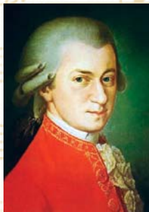
Wolfgang Amadeus Mozart

Since the 18 th century, the lands encompassing the Danube River Valley—Austria, Hungary and Germany—and the Czech Republic have bequeathed to the world an unparalleled musical legacy.