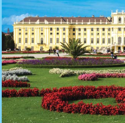
Admire the Rococo grandeur of Schönbrunn Palace, the residence of Habsburg royalty from Marie Antoinette.

stunning 18 th -century ceiling frescoes by Paul Troger. In Melk Abbey's beautiful kirche (church), admire the perfectly intact multi-panel 16 th -century altarpiece by Danube School master Jörg Breu the Elder.