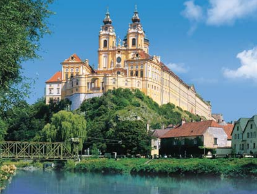
Founded in 1089, the Austrian Benedictine Abbey of Melk houses a world-renowned monastic library.