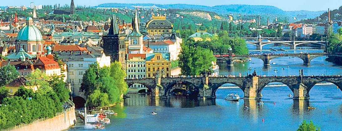
Photo this page: In Prague, the “City of a Thousand Spires,” the famous Charles Bridge links the medieval Old Town with the splendid Baroque palaces of the Little Quarter, the city’s most intact historical district.

the Royal Mausoleum and spectacular St. Wenceslas Chapel. Walk through the “Golden Lane,” a quaint byway lined with small, Mannerist-style houses and workshops once occupied by castle goldsmiths, alchemists, artisans and guards. Author Franz Kafka was said to have lived here between 1916 and 1917.