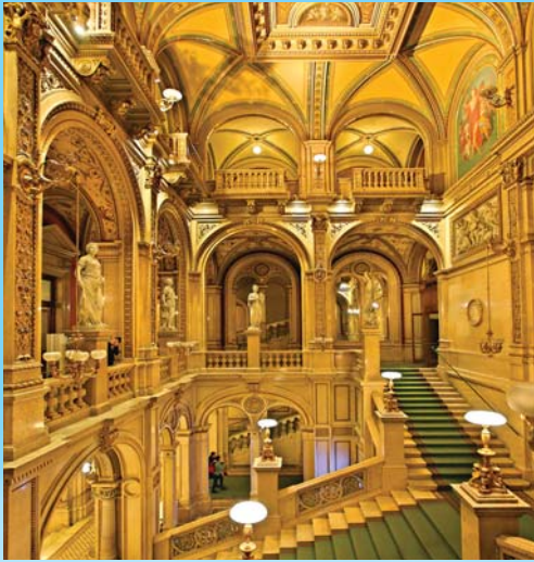
The original opulence of the 19 th -century Vienna State Opera is preserved in its central staircase and foyer.

Palace and Gardens, the spectacular summer estate of the imperial Habsburgs. It was here, in one of the grand salons decorated in a priceless collection of art and antiques, that a six-year-old Mozart first performed for Empress Maria Theresa and her daughter, the future Queen of France, Marie Antoinette.