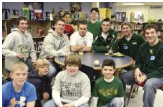
Tribe baseball players with New Kent Elementary School students.

And while the beginning of the season means the Tribe gets busier, the lessons the